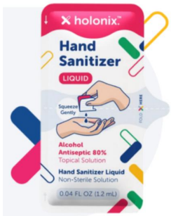
Holonix Hand Sanitizer