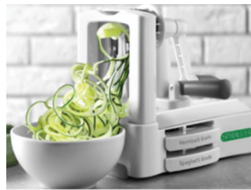
Spiralizer Vegetable Slicer