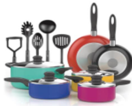
Vremi Kitchen Set