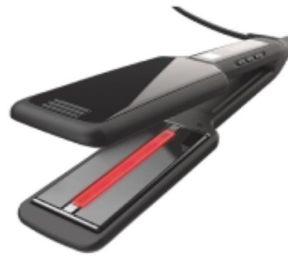
Xtava Infrared Hair Straightener